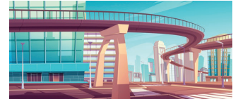
State of the art infrastructure