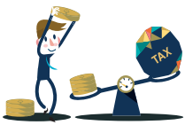
Competitive tax regime