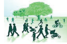
Low crime and pollution