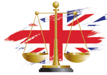
English legal system